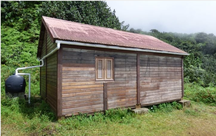
Attribution : refuge de La Citerne (PNG)