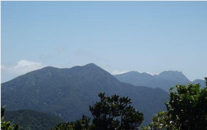
Vue depuis le Piton de Bouillante