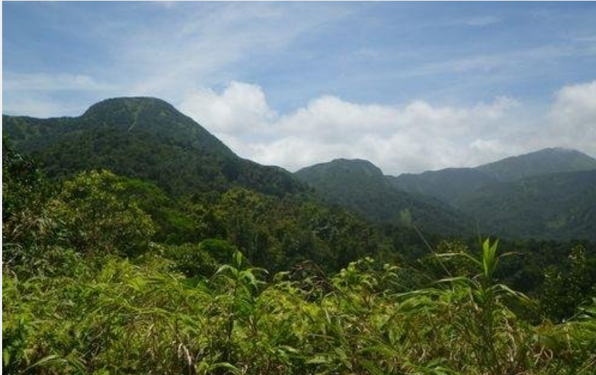
au sommet des Trois Crêtes (Emilie Savy / PNG)