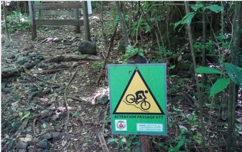
signalétique VTT (C.Lesponne - PNG)