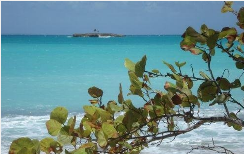
l'îlet de Vieux Fort (PNG)